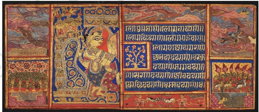
Indra praising Devasano Pado, Kalpasutra, Gujarat, about 1475. Collection: Boston

Jain paintings developed a schematic and simplified language for painting, often dividing the space into sections to accommodate different incidents. One observes a penchant for bright colours and deep interest in depiction of textile patterns. Thin, wiry lines predominate the composition and three-dimensionality of the face is attempted with an addition of a further eye. Architectural elements, revealing the Sultanate domes and pointed arches, indicate the political presence of Sultans in the regions of Gujarat, Mandu, Jaunpur and Patan, among others, where these paintings were done. Several indigenous features and local cultural lifestyle is visible through textile canopies and wall hangings, furniture, costumes, utilitarian things, etc. Features of the landscape are only suggestive, and usually, not detailed. A period of roughly hundred years from about 1350–1450 appears to be the most creative phase for Jain paintings. One observes a shift from severely iconic representations to inclusion of attractively depicted aspects of landscape, figures in dance poses, musicians playing instruments, which are painted in the margins of the folio around the main episode.