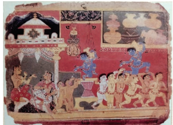
Mitharam , Bhagvata Purana , 1550

With several regions in the north, east and west coming under the rule of the Sultanate dynasties from Central Asia after the late twelfth century, another strain of influence—