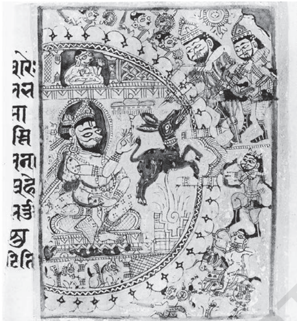
Kalaka is seen on the lower right and his captive sister is depicted towards the top left. The donkey with magical powers is spewing arrows at Kalaka's army of kings. The evil king presides from the inside the circular fort.