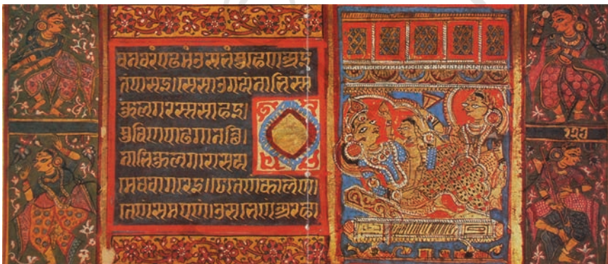
Birth of Mahavir, Kalpasutra, fifteenth century, Jain Bhandar, Rajasthan

Jain painting also received impetus because the concept of shaastradaan (donation of books) gained favour amidst the community, where the act of donating illustrated paintings to the monastery's libraries called bhandars (repositories) was glorified as a gesture of charity, righteousness and gratitude.