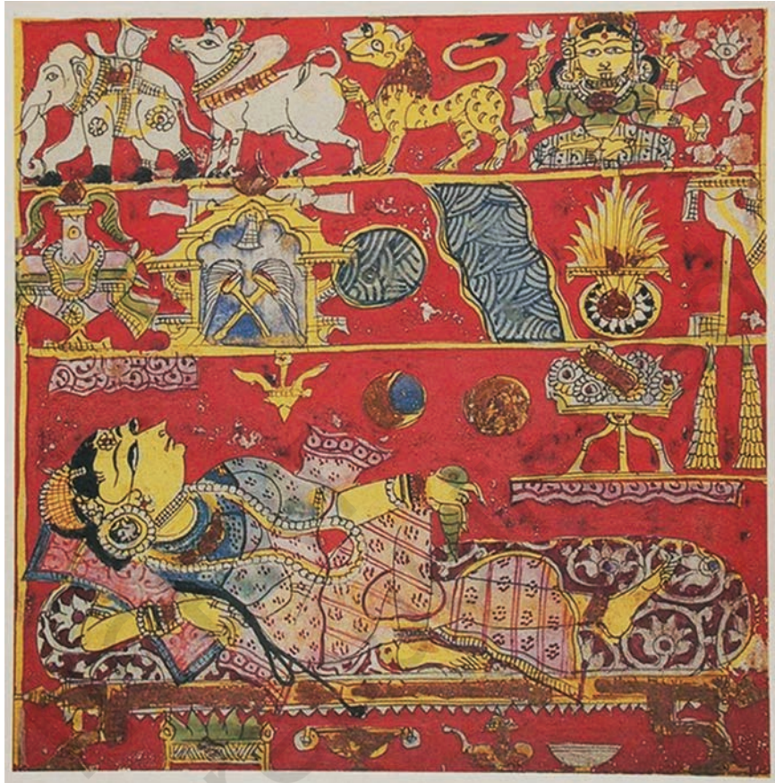
Trishala's fourteen dreams, Kalpasutra , Western India

events leading to and around these—comprise most part of the Kalpasutra .