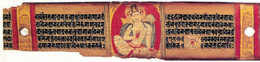
Lokeshvar, Astasahasrika Prajnaparamita, Pala, 1050, National Museum, New Delhi

This practice enabled the dispersal of Pala art to places, such as Nepal, Tibet, Burma, Sri Lanka and Java.