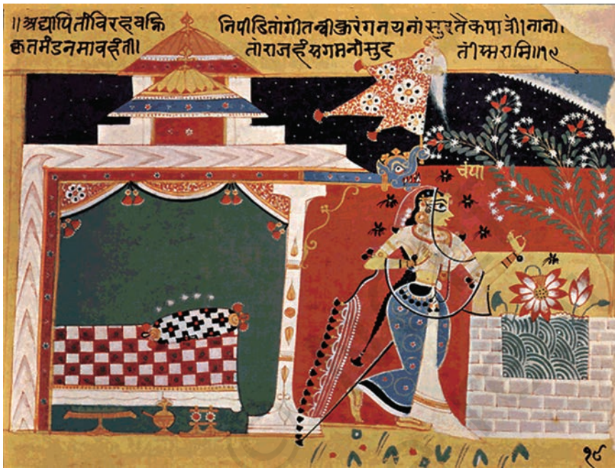
Chaurpanchashika , Gujarat, fifteenth century, N. C. Mehta Collection, Ahmedabad, Gujarat

A large group of works of the same period, portraying Hindu and Jain subjects, such as the Mahapurana , Chaurpanchashika , Aranyaka Parvan of the Mahabharata , Bhagvata Purana , Gita Govinda , and few others are representative of this indigenous style of painting. This phase and style is also casually referred to as pre-Mughal or pre-Rajasthani, which is largely synonymous with the term 'indigenous style'.